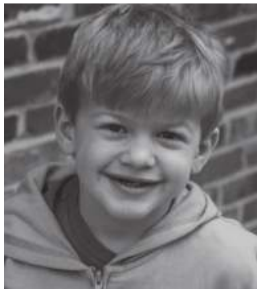
Jackson (MPS II)

When planning to remodel or modify your home, consult with professionals, such as architects and reliable builders. Some of these professionals specialize in accessibility problems and may suggest novel solutions to your very unique problems.